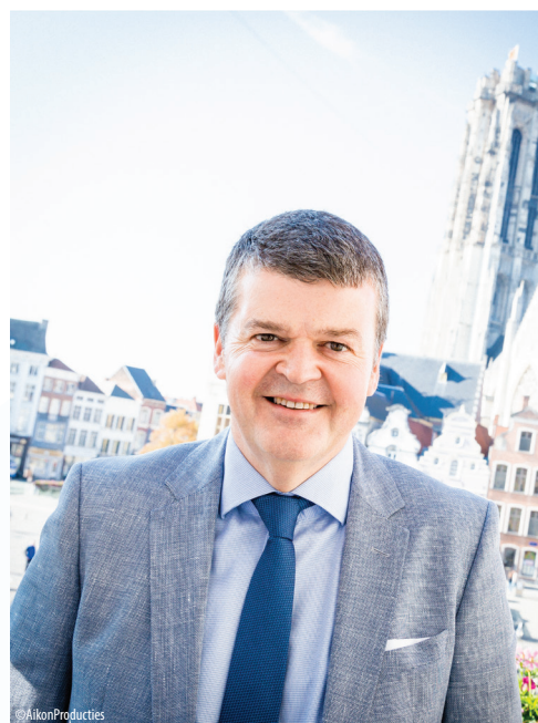
Bart Somers , Mayor of Mechelen

We also think that this publication will be of interest to liberal politicians and activists working at any level of government, as a useful source of reference for the liberal principles that guide their political action. Let's build a liberal Europe and a liberal world together!